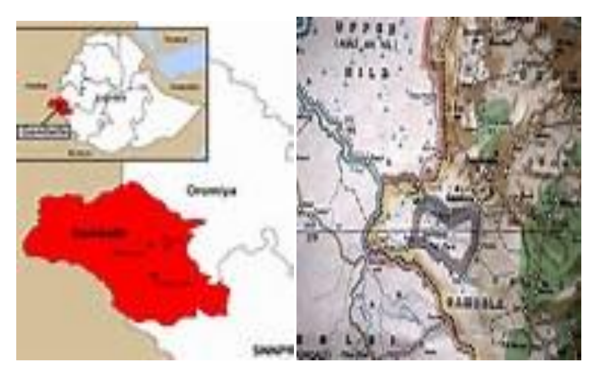
Gambella-relative location in Western Ethiopia

The region is dominated by a tropical rainy climate with the escarpments of Eastern Gambella receiving more rainfall than the drier lowlands along the Sudanese border. A single maximum rainfall regime running from Feb/Mar to Oct/Nov characterizes the region. Annual rainfall averages about 600 mms. Mean temperatures vary from 35 to 40 degrees C over most parts. Along the higher eastern escarpments, mean maximum temperature reaches 27-32 degrees C. Deciduous woodlands, riverine forest and tropical grassland dominate the natural vegetation. The 5, 061 sq. km Gambella national park is found in the region. (ibid)