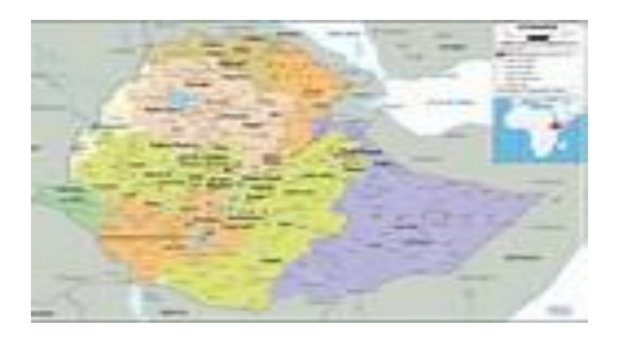
The 9 regional states (kilils) of Ethiopia